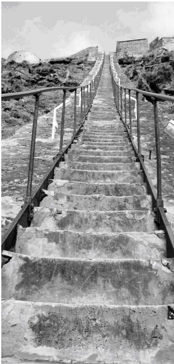
Jacob's Ladder, Jamestown